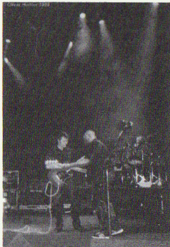
18 - In A Big Country 19 - Fields of Fire (scratch)

THANKS TO OLIVER HUNTER AND MIKE LYND FOR THIS